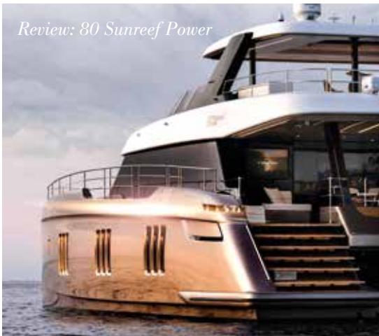
Review: 80 Sunreef Power

154 LUXURY 166 EVENTS 175 CLASSIFIEDS 184 LAST SHOT