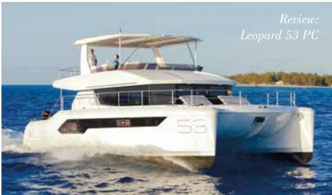
Review: Leopard 53 PC

Successor to the most popular powercat of all time, the Leopard 53 PC debuted in February and arrived in Asia by March.