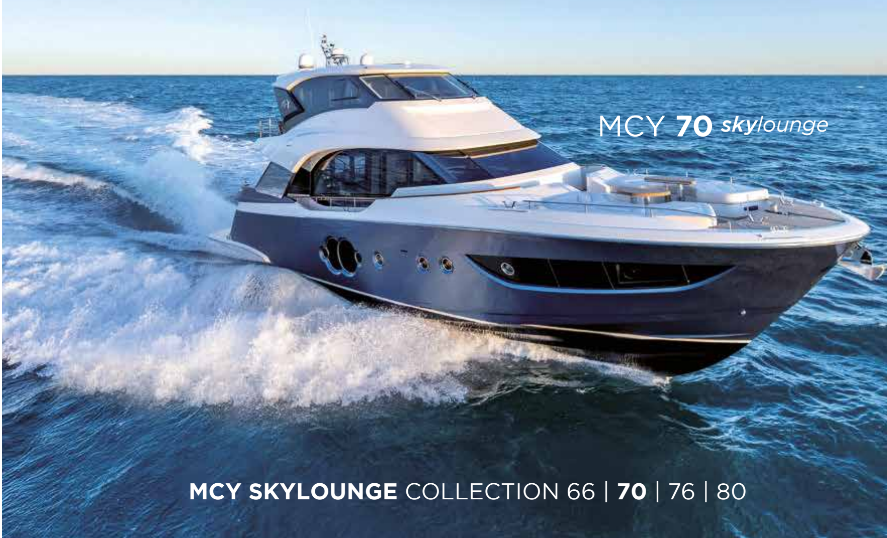
MCY 70 skylounge

MCY SKYLounge COLLECTION 66 | 70 | 76 | 80