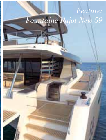
Feature: Fountaine Pajot New 59