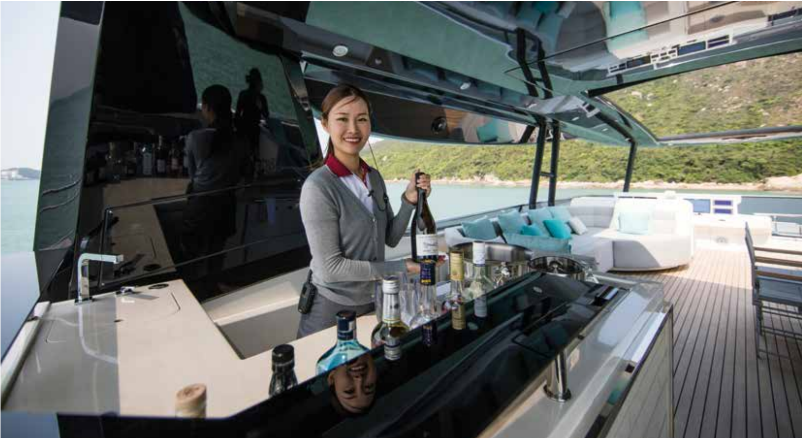
The bar is the focal point of the flybridge; its counter and stool seats are crafted from carbon Kevlar to match the deck’s T-top

www.montecarlo-yachts.it www.asiayachting.net