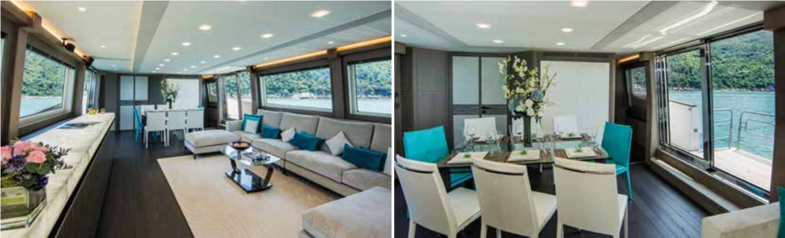
The enormous saloon (left) has been customised for Asia-based clients; the dining area (right) benefits from sliding doors and a drop-down balcony