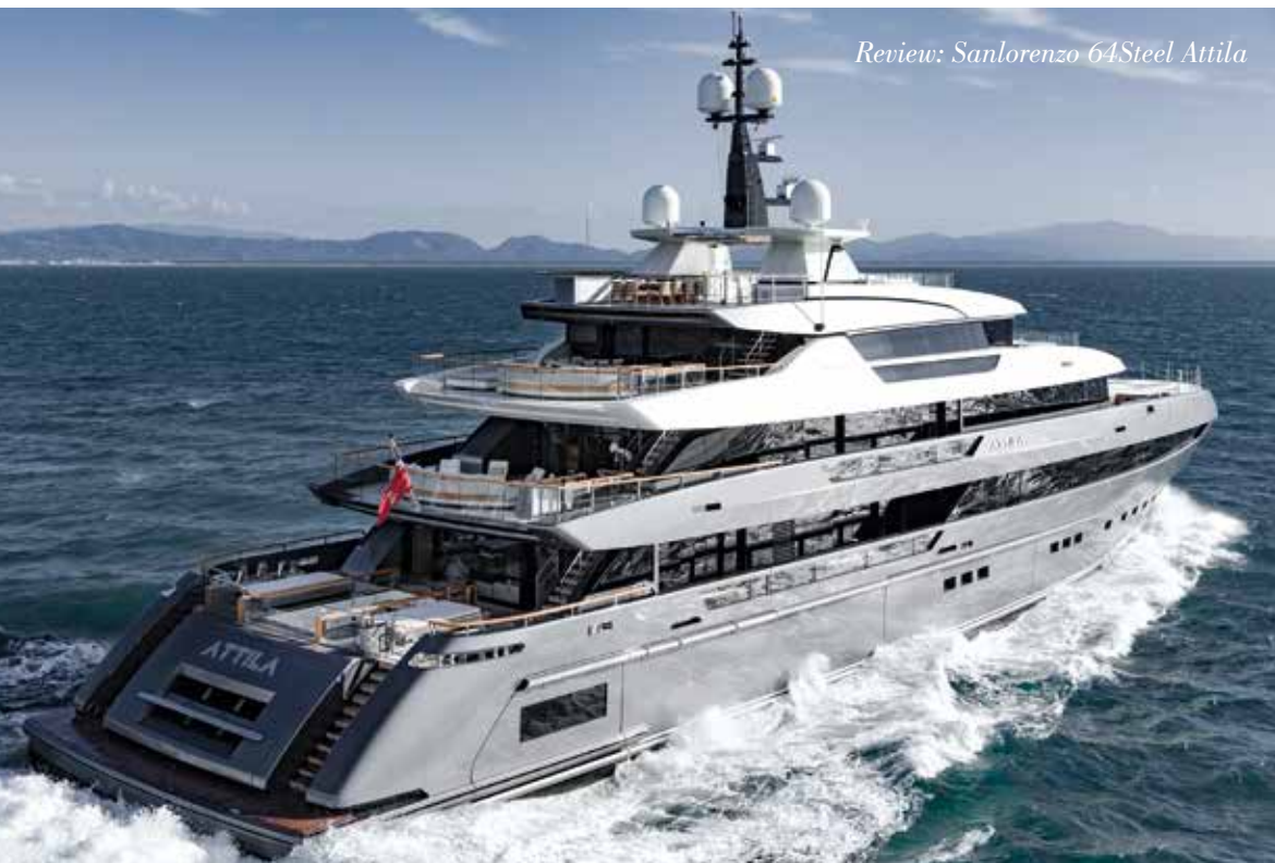
Review: Sanlorenzo 64 Steel Attila

Over three times the volume of Sanlorenzo's previous flagship, Attila is even more notable for its groundbreaking aft layout, where a stunning beach club and see-through pool create a floating wonderworld.