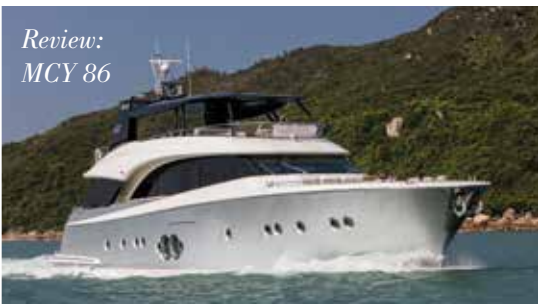
Review: MCY 86