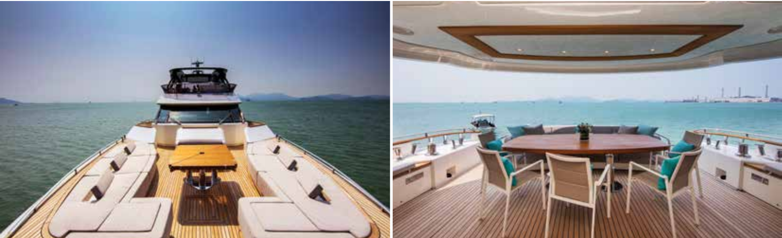
The multi-functional foredeck (left) and covered aft cockpit (right) are among the popular outdoor areas on the 86ft yacht, which is in Hong Kong and available

Forward of the dining area, to port, are double doors to provide privacy for guests from the crew area, which includes a lobby beside the starboard helm station, aft of which are stairs to the flybridge. The lobby also has steps down to the lower deck, where the galley and crew mess are to port, with the Captain's cabin and a twin in the bow. The helm station, which incorporates centralised Böning electronic controls for the whole yacht and Raymarine navigation, merits its roominess as the yacht's range is 1,200nm, potentially enabling regional cruising. With this in mind, Besson installed the slightly larger propulsion option of twin MAN V12 1,900rpm engines and opted for a second generator. The shipyard selected both the engine and generator for their comparatively eco-friendly impact. Asia Yachting helps clients arrange regional tours with appealing cruising itineraries that can include staff crew taking a yacht to Thailand, Malaysia or the Philippines, to await time-pressed owners who fly in. Owners can also take delivery in Europe and cruise in the Mediterranean before their yacht is shipped to Asia.