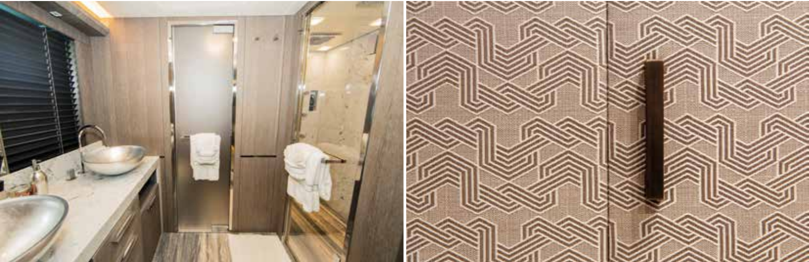
The master cabin en-suite bathroom (left); Hermès and Armani Casa fabrics provide a luxurious look and feel

crafted from carbon Kevlar to match the deck’s T-top, which can open up to the sun or stars. SLEEPING ARRANGEMENTS On the lower-deck, the four ensuite guest cabins include an impressive full-beam master suite midships and a forward twin cabin. Suitable for owners and their children, both rooms share a staircase that starts starboard of the dining area. In the spacious master, Italian-designed silk and leather is used for the wallcoverings and decorative cabinet and door surfaces, while the owners also benefit from an ample walk-in closet, as well as a beautiful marble-walled ensuite bathroom with twin basins and twin rainforest showers.