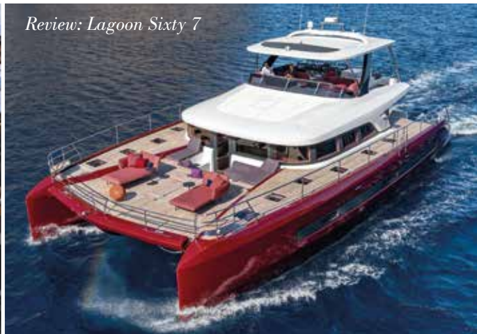
Review: Lagoon Sixty 7