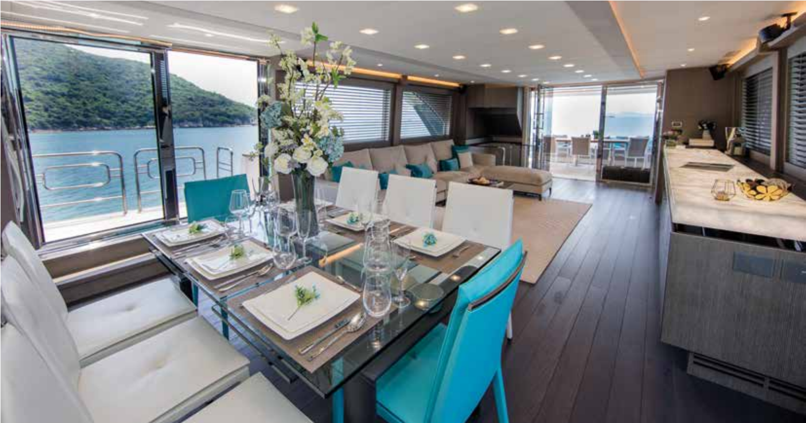
Pale ochre alabaster marble has been used on the port-side countertop (on right), as well as the bulkhead forward of the dining table