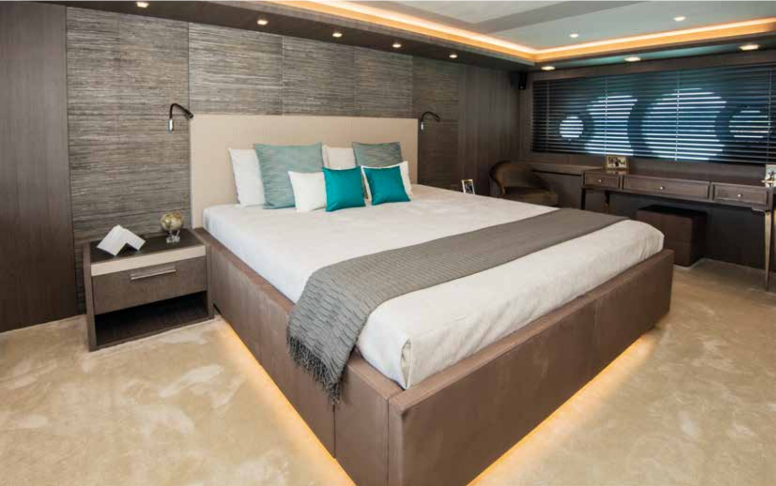
Accessed by a forward staircase, the full-beam master suite benefits from Monte Carlo Yachts’ iconic overlapping-circle windows

The swim platform can lift up to 1.2 tonnes, handy if a large tender is selected or perhaps for weighty toys kept in the garage. It also fits a tall, attractive chrome shower that can be erected on demand, while a water-resistant day head is a few steps away, next to the cockpit. At the bow, a Portuguese deck layout features a seating area and expandable dining table that sits up to 12 in comfort, offering great waterside visibility. For the flybridge, “the idea was to try to create a different living and entertaining area,” says Besson, who installed a pop-up TV in the lounging area behind the twin-seat helm. The focal point, though, is the bar station with its panel of backlit alabaster that conceals a large grill. Its counter and stool seats are