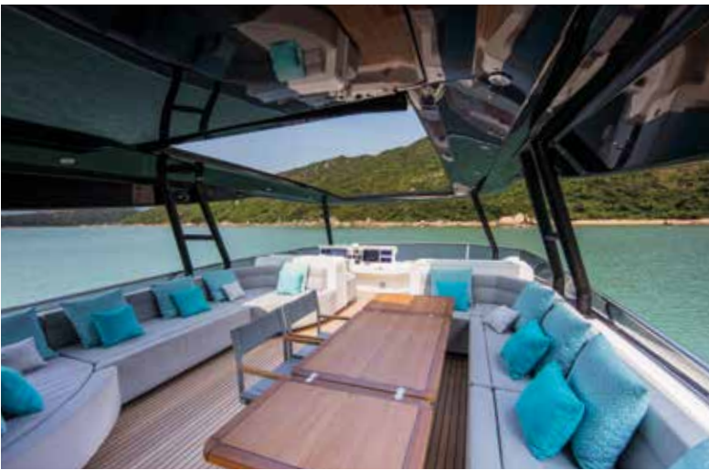
The huge carbon hardtop can open for a clear view of the sky or stars

There’s a VIP double and another twin aft, accessed by a separate staircase before the saloon sofa. Not only do all internal doors carry the satisfying weight of quality but, when closed, they provide effective soundproofing that’s enhanced by a layer of rubber that seals each modular-construction cabin, also reducing vibration. A previous MCY 105 commission for Asia Yachting was for a Hong Kong client that comprised two brothers, who both had young children. They requested shared, easy-access three-tier bunk-bed cabins for the kids as well as two master cabins of equal size for the parents. “Each master was absolutely tailored to each brother’s preferences,” Besson says. All in all, this MCY 86 – currently on the market – offers both a very high level of finish and, in this configuration, an abundance of different areas around the yacht where people can easily find their comfort zone. ☼