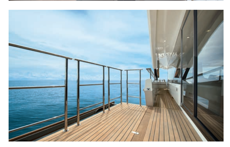
Top: The enormous saloon is bathed in natural light. Middle: Sliding doors offer great views and breeze. Bottom: A drop-down balcony can be created on the main deck.