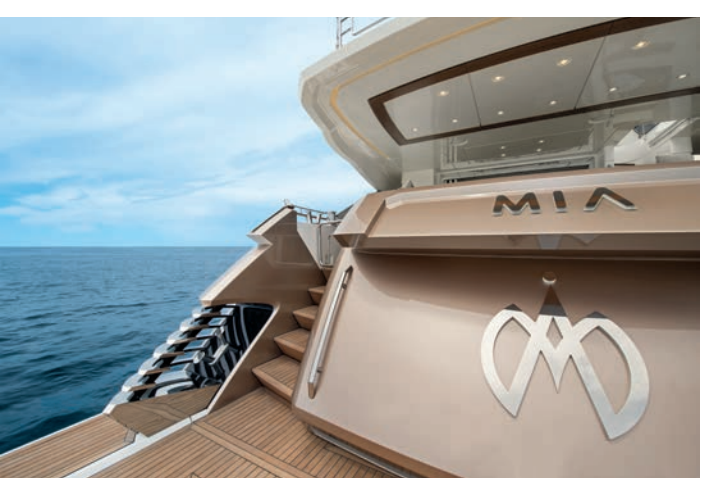
Top and left: The 96-footer can reach up to 27 knots. Middle right: Mia's eye-catching swim platform. Bottom: The roomy aft cockpit.