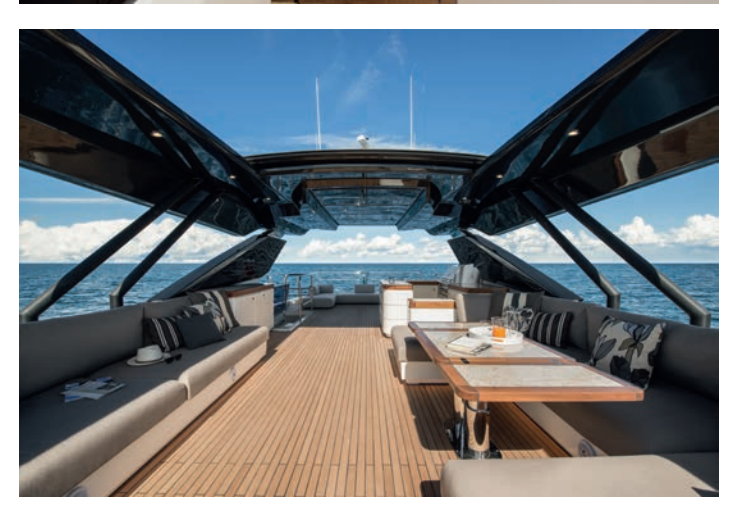
Top: The foredeck has three sofas around two foldable tables.

Middle: The side decks feature two sets of steps. Bottom: The flybridge is open to customisation.