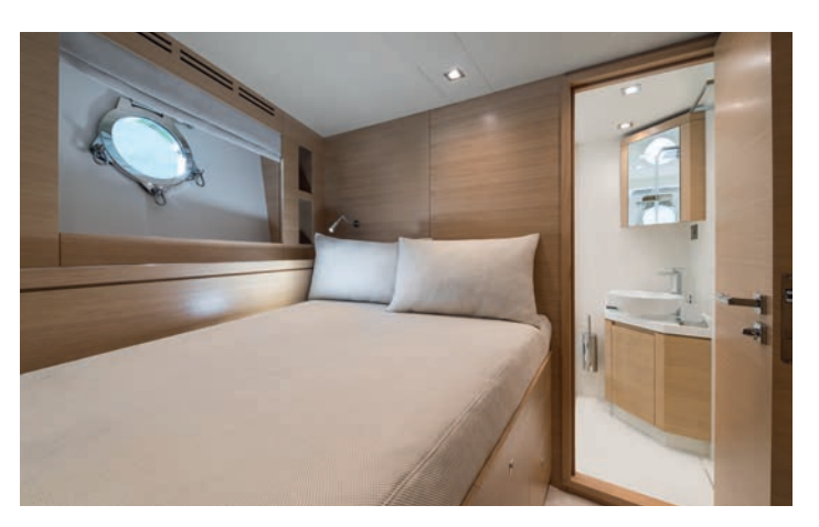
Top: The elegantly designed wheelhouse. Middle: The galley is large, bright and comfortable. Bottom: One of three crew cabins.

The flybridge is accessed by starboard stairs from the aft cockpit and Mia features a loose arrangement of low sofas aft, a fantastic bar and barbecue set-up to port, and lots more seating up front including a large C-shaped sofa around a foldable table.