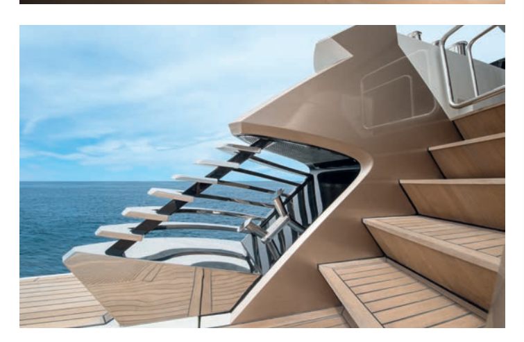
Top: Mia will show at Europe's biggest shows in September.

owners who attended the launch of Mia and followed up by visiting the nearby Nuvolari-Lenard office to discuss the design of their dream boat.