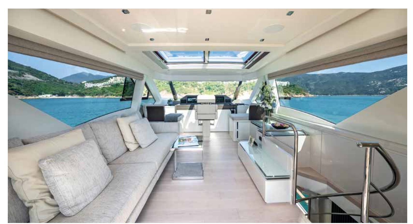
The spacious skylounge includes huge side windows, a retractable skylight, the sole helm station, and stairs to the saloon on the main deck

An oversized TV in the ceiling panelling can be lowered or concealed at the press of a remote-control button. To port, just inside the cockpit doors, is a day head carefully concealed behind dark chocolate brown-coloured wooden louvred slats. This space can be alternatively configured as a storage room or for access below deck to crew quarters and storage for the water toys.