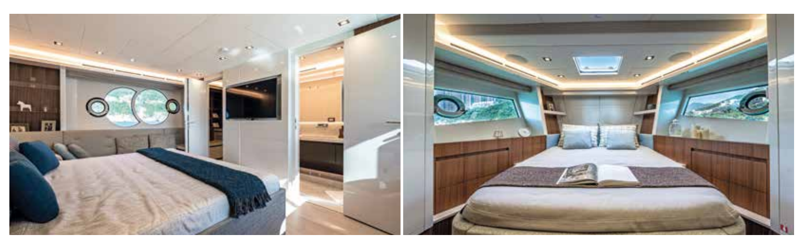
The full-beam master suite midships (left) has private access from the aft of the saloon and the shipyard's iconic overlapping circular windows; the VIP cabin (right) is in the bow

The guest cabins have separate access via another walkway from