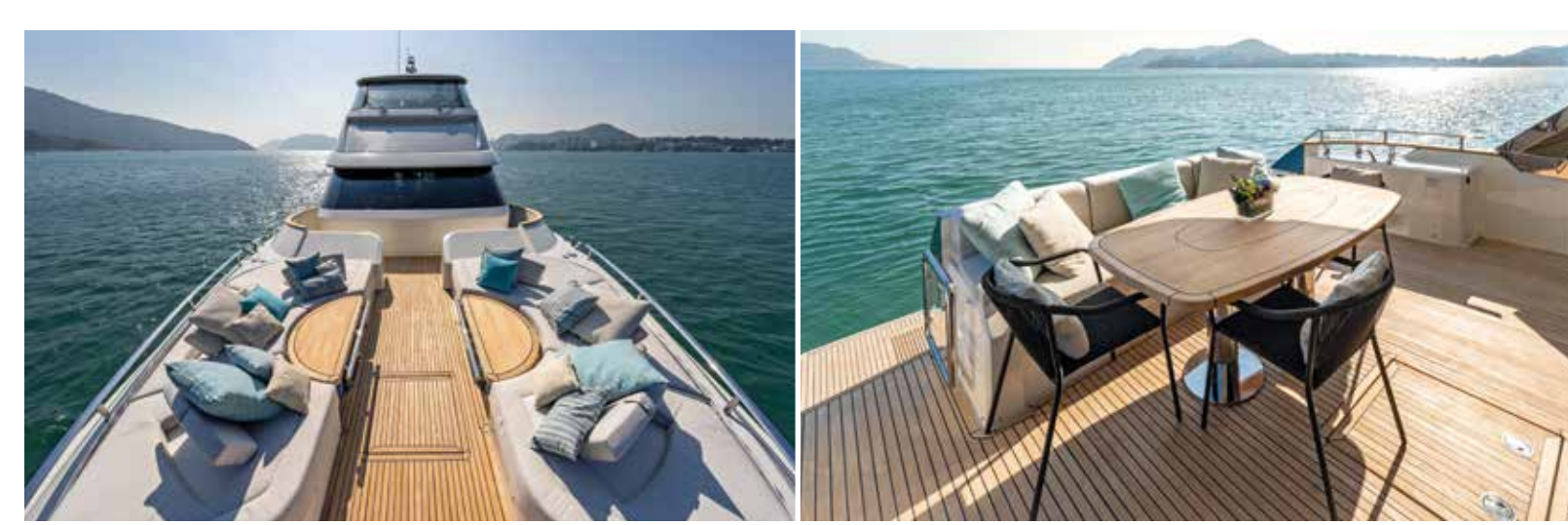
The yacht retains the flexible foredeck (left) of the MCY 70, one of three new MCY models in 2019; the aft cockpit on the main deck (right)

"This is one of the most important features that we know local owners appreciate," he says. "Owners are keen to escape the high humidity we have in Hong Kong and in other parts of Asia. When you sit upstairs you feel as if you are inside, but because of the panoramic windows and the glass roof (a retractable skylight), you feel in touch with nature and the environment outside.