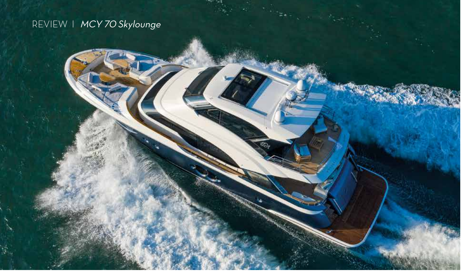
The MCY 70 Skylounge on the run in Hong Kong, home of regional dealer Asia Yachting, which represents Monte Carlo Yachts in Hong Kong, Macau and five key Southeast Asian countries

sia Yachting is kicking off 2021 in lively fashion as the regional dealer hosts the Asian 'reveal' of the MCY 70 Skylounge online from Hong Kong and continues private viewings of the eye-catching new model.