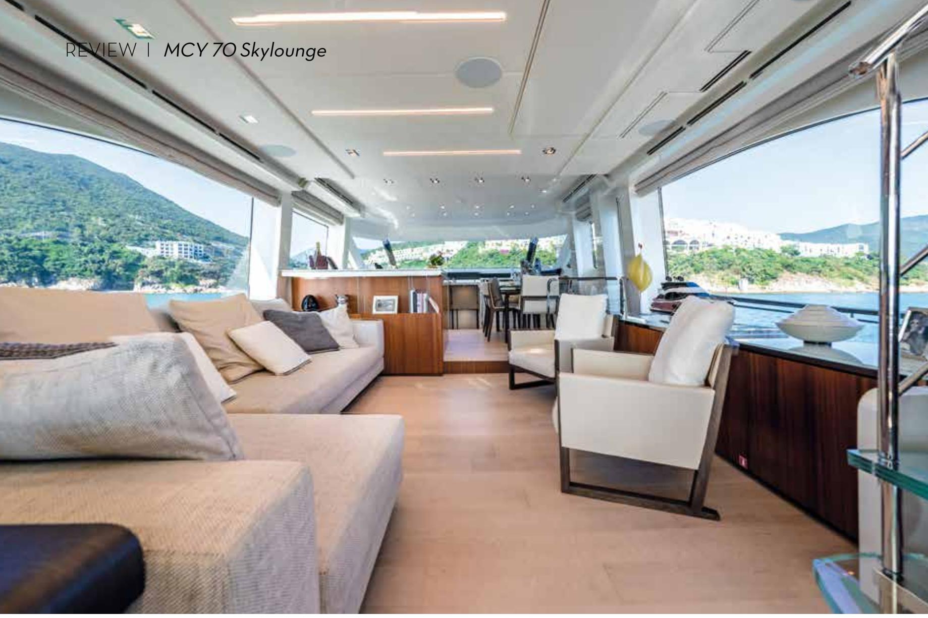
As well as starboard stairs to the skylounge, the saloon features a large galley and dining area forward, in a space partially occupied by the helm station on non-Skylounge models