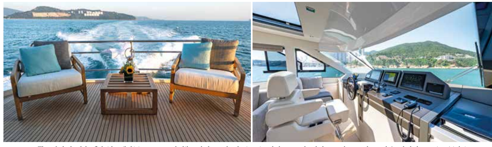
The aft deck of the flybridge (left) is a cosy nook, like a balcony for the interior skylounge; the skylounge houses the yacht's sole helm station (right)

"When the yacht arrived, I was particularly impressed by the cosy feel of the intimate terrace at the back of the flybridge – great for two people or a couple to relax and have a private moment. It would be a good spot to enjoy a cigar."